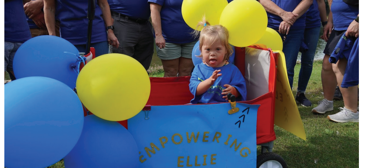
Above: A young participant enjoys the festivities at the 2024 Buddy Walk. Below: 2024 attendees at Langan School at Prospect Center Prom.