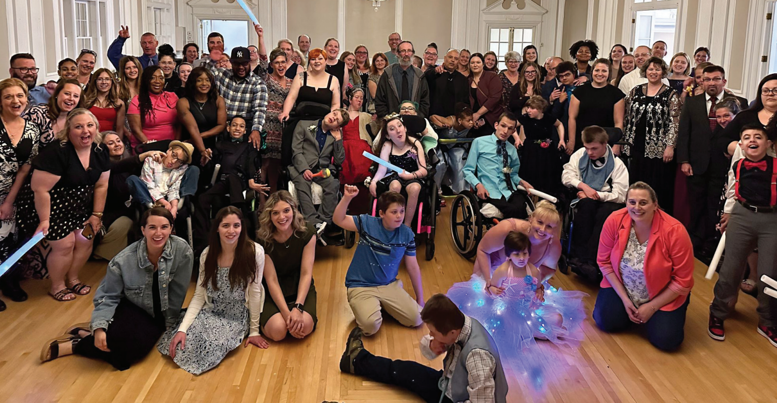
Clockwise from the top: 1) Prospect Center prom cheer for the awesome time had by all. 2) The Center's annual Holiday Party festivities are a tradition everyone looks forward to. 3) Ribbon cutting of the Albany Med Health Systems new Blood-Draw Lab located at Center Health Care. 4) Staff and their guests gather to celebrate achievements at the annual CP State Conference.