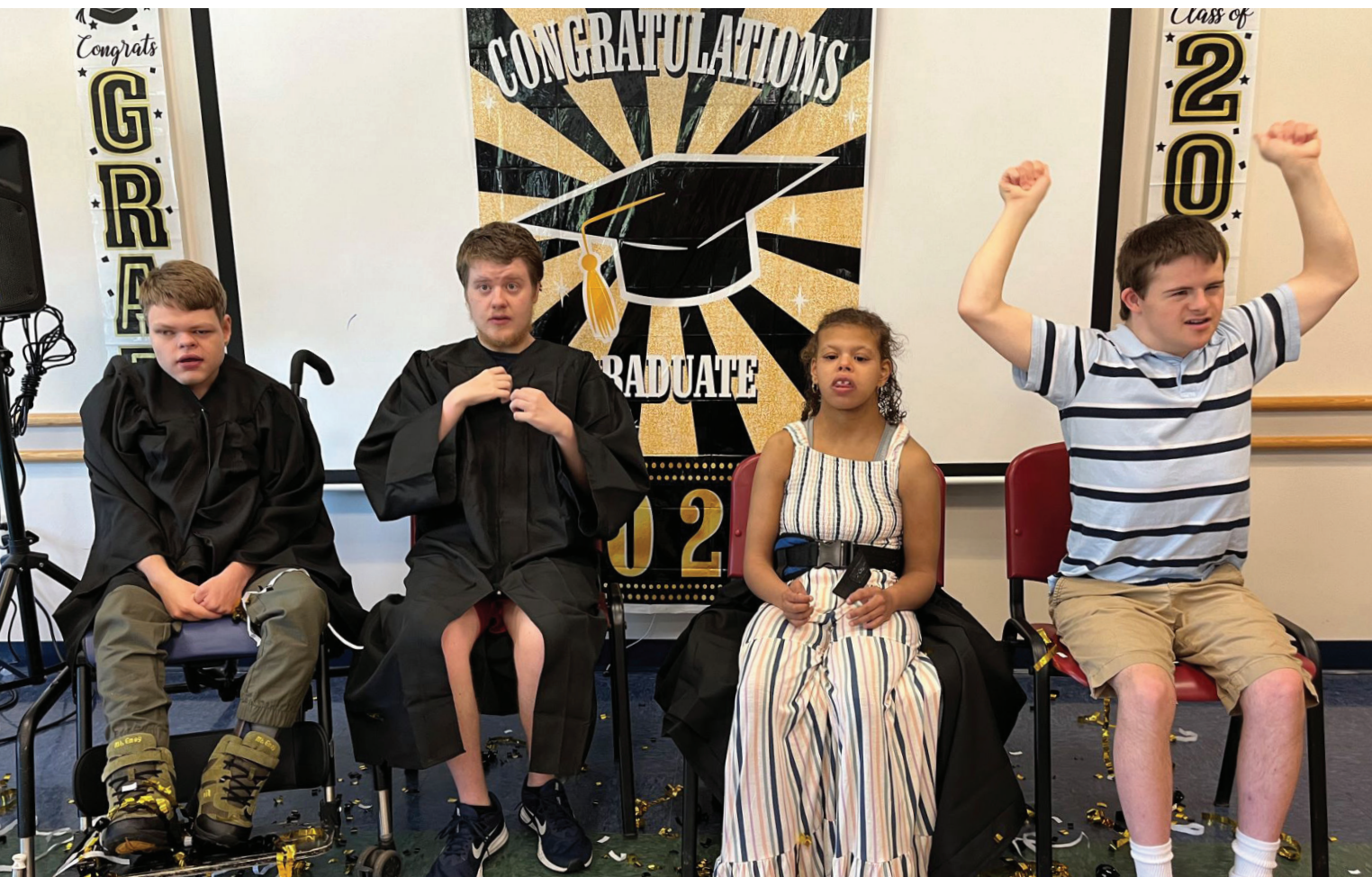
2024 Graduates of Langan School at Prospect Center.

2024 was filled with proud moments, and we're looking forward to many more in the year to come!