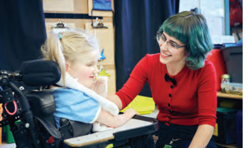
Our school programs, accredited by the New York State Education Department , are operated by New York State certified teachers and staff.